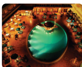
Sheraton Cairo Hotel & Casino Galae Square, Cairo, Egypt